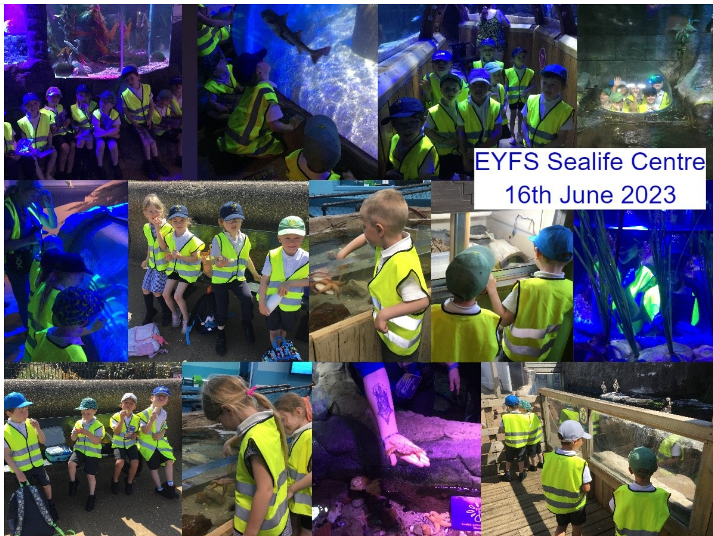
EYFS Sealife Centre 16th June 2023