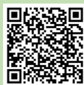
Online Safety Policy including Acceptable Use